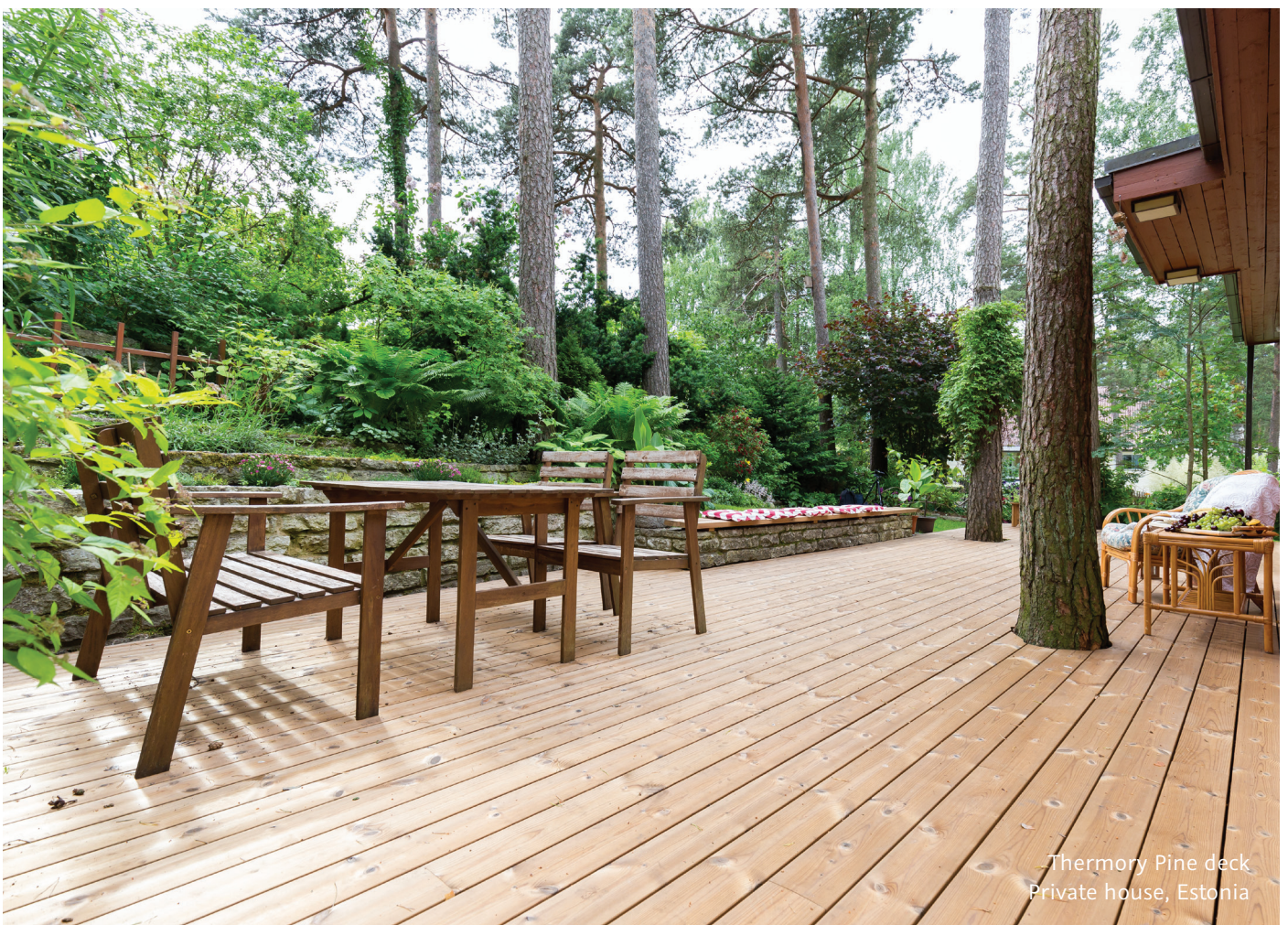
Thermory Pine deck Private house, Estonia

Thermory AS procures Scots Pine from Northern Europe, from region that takes care of the forest responsibly and sustainably.